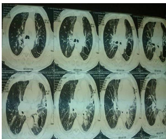
Figure 2. Chest CT scan in admission time.