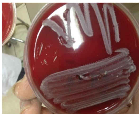
Figure 4. Culture of abscess contents.

The contents of the abscess were drained and sent for smear and culture (Figure 3, 4). Gram staining revealed the beaded branching filaments and weakly acid-fast filaments. The morphology of colonies was compatible with Nocardia in culturing on blood agar (BA), colombia agar with colistin, and sabouraud dextrose agar (SDA). Microbial and biochemical tests such as modified acid fast staining, catalase, growth in lysozyme, hydrolysis of casein, tyrosine, xanthine, hypoxanthine, and uric acid were used for Nocardia spp. confirmation. Also, using biochemical differential tests and sequence analysis of 16sRNA, the Nocardia spp was confirmed as N. farcinica IFM10152DNA in gene bank. Smear and culture for fungal infections were negative. The NBT*8 and immunoglobulin level (IgM, IgG, IgG) were within normal limits, and HIV*9 antibody assay was negative in two steps.