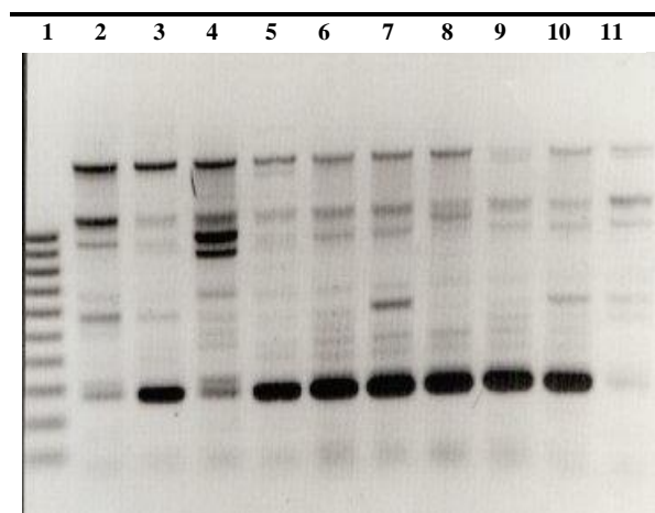
Figure 3. Ten distinct ERIC-PCR subtypes of Fusobacterium necrophorum . Lane 1: 100bp ladder marker; lanes 2-11: PCR type