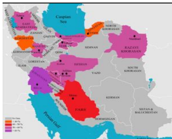
Figure 2. The prevalence of MRSA in the year of 2012 (28).