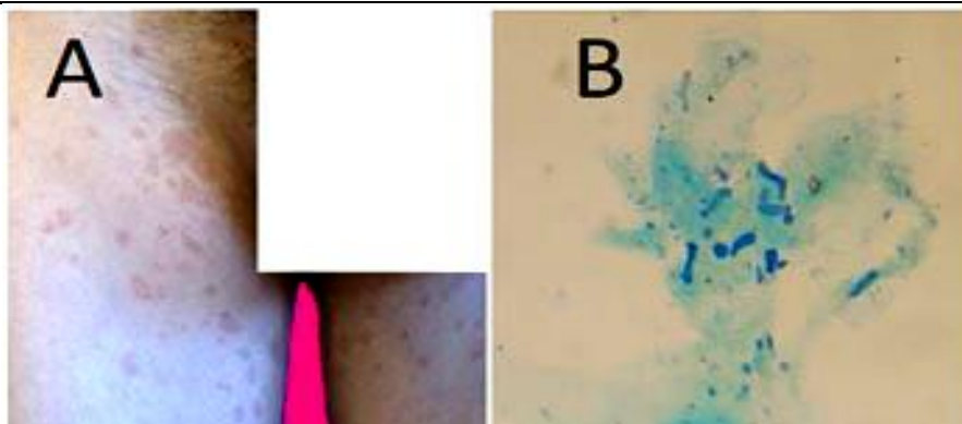
Figure1: Macroscopic and microscopic appearance of TV.

Tehran, Iran. Clinically, lesions were macules with clear margin and slight scaling and pigmentation (Figure-1-A). During the involvement, patient had not used any antifungal drugs. After sampling with a sterile scalpel and scotch tape, direct smears with 15% Potassium hydroxide (KOH) and staining with methylene blue were prepared. In direct microscopic examination, budding yeast cells with typical scar and short curved mycelium were observed (Figure -1-B). Observed characteristics were related to Malassezia . For diagnosis and identification of Malassezia species, differential tests were performed including culture on Sabouraud dextrose agar and mDixon agar media (E. Merck, Germany), assimilation of different Tweens, catalase reaction, and splitting of esculin. By comparing the obtained results with the other study's findings (8), M. furfur was identified as the agent of the disease (Figure-2-A and 2-B). For patient, oral ketoconazole and ketoconazole shampoo were prescribed and recovered.