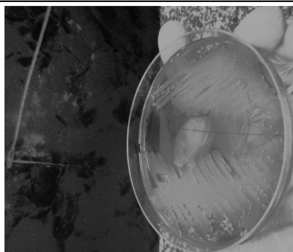
Figure 1. HV phenotype. Illustration of a positive string test: formation of viscous strings >5 mm in length.

The greatest proportion (119 out of 130 isolates, 91.5%) of the isolates were negative for magA , in which 52 isolates were positive for ESBL (22 isolates from urine, 10 isolates from blood, 8 isolates from wound, and 12 isolates from the other samples). Some of the isolates in all age groups possessed magA and produced ESBL. Additionally, some of the samples collected from males (3 out of 65 isolates) and females (1 out of 65 isolates) contained both magA genes and produced ESBL. Results are summarized in Table 1.