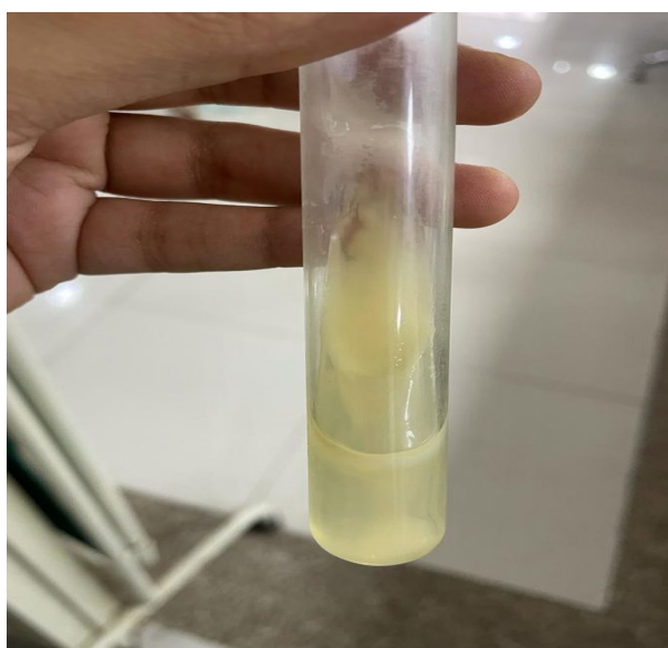
Figure 2) Sabouraud dextrose agar showing cryptococcal growth