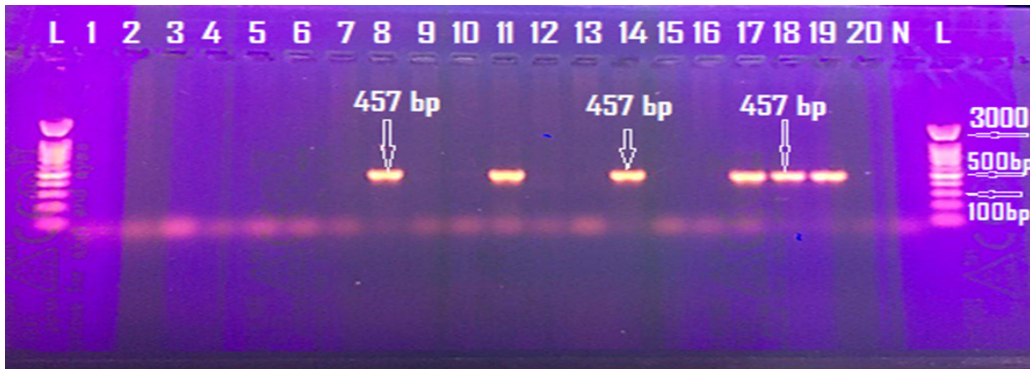
Figure 2) Gel electrophoresis products of the qnrB gene of E. coli with a 300 bp size; L: DNA marker, wells 8, 11, 14, 17, 18, and 19: positive samples, and N: negative control in this study