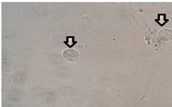
Figure 2) Wet smear containing Trichomonas vaginalis from Diamond medium after 72 hours of incubation at 37 ° C. x400